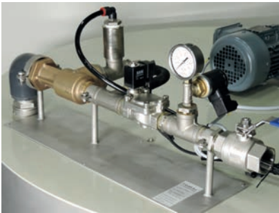
Inlet armatures including the high-effective injection nozzle.

PolyRex Liquid is designed to be as user-friendly and maintenance free as possible. The unit is easily controlled via the PLC touch screen display.