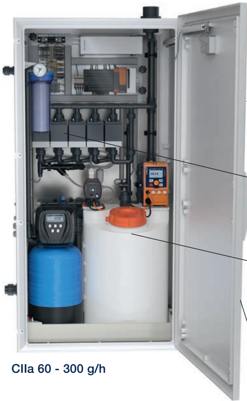
CIIa 60 - 300 g/h

With innovative technology in the tightest of spaces.