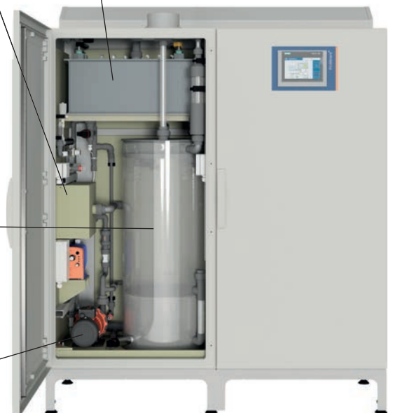
CIIa 625 - 2.500 g/h

Integrated product pump transports the hydrogen-free hypochlorite solution into the external product container.