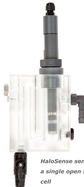
HaloSense sensor in a single open flow cell

The HaloSense sensor is a three electrode chrono amperometric potentiostatic sensor. The free chlorine molecules diffuse through the membrane and come into contact with the electrolyte. The electrolyte has a low pH which converts the majority of the OCl - to HOCl. All the HOCl is reduced at the gold cathode and the resultant ions travel through the electrolyte where they are oxidised at the silver/ silver chloride anode. The current flow is proportional to the concentration of free chlorine in the sample. The anode and cathode are held at the potential difference that provides an optimum catalytic reduction of HOCl.