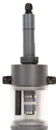
HaloSense sensor in a single closed flow cell