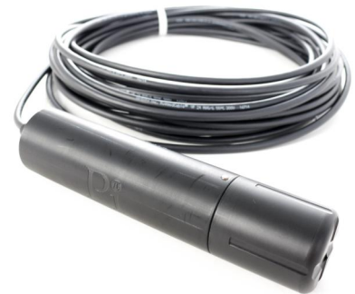
Fig. 1: Dissolved Oxygen Sensor - OxySense

Early measurement of online DO in waste water was made by electrochemical cells that needed sacrificial electrodes, electrolyte, membranes and a lot of calibration. Whilst there are some companies still advocating the use of this technology it was largely replaced in the 1990s and 2000s with online optical measurement. The vast majority of online DO systems used today are optically based similar to the sensor shown in Figure 1.